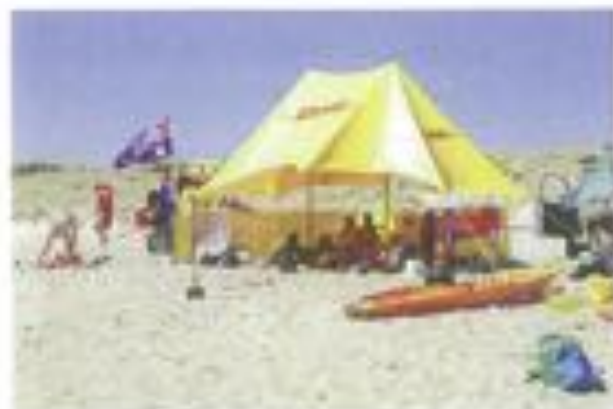
Australia Day Patrol