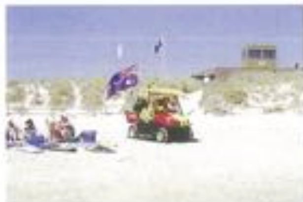
Rhino on Patrol on Australia Day

As a Club, we are going in the right direction, but as always, we still need to keep improving and changing. So to all – Great work and thank you for your efforts this season.