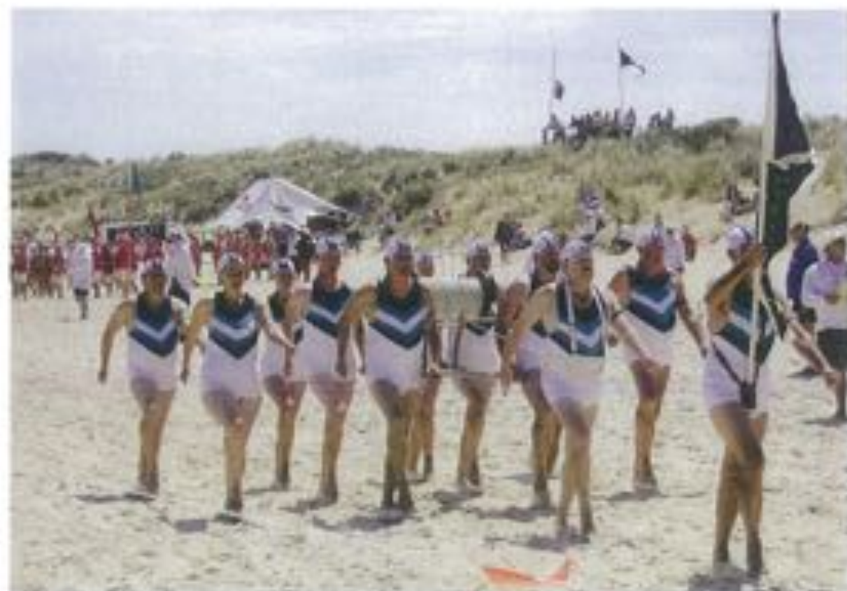
South Port March Past Team Bronze Medal Aussies 2009.